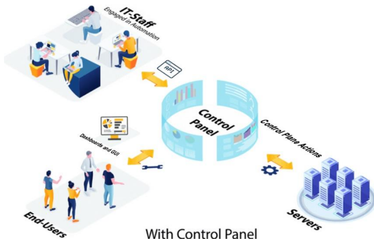
End-Users get self-serve GUI portals to execute their respective operations themselves IT-Staff primarily engaged in IT-Automation using provided APIs and control panel extends 'Control Plane Actions' to manage other critical tasks.

The IT department also makes use of the APIs provided by the Control Panel; except that their typical use is to automate the tasks through workflows or to conduct different other actions in bulk.